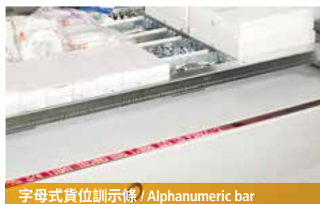
字母式貨位訓示條 / Alphanumeric bar