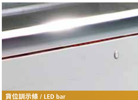
貨位訓示條 / LED bar

They guide the operator to the location of the items within the tray and noticeably reduce errors.