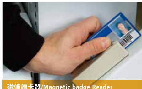
磁條讀卡器/Magnetic badge Reader