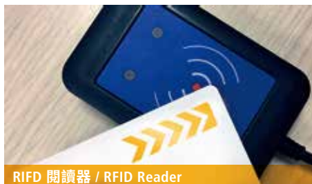
RFID 閱讀器 / RFID Reader

These devices protect stored materials from unauthorised access. You can give different users access to different trays/materials or compartments based on their permissions. Access can be granted using a login and password entered into the console, or it can be achieved using a strictly personal device which makes the operation very quick.