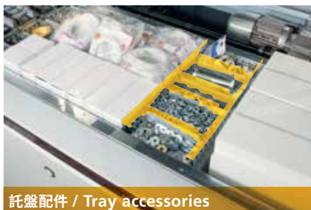
託盤配件 / Tray accessories

These options mean that the layout of materials in the trays is incredibly flexible and easy to modify.