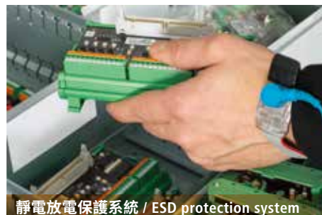
靜電放電保護系統 / ESD protection system

1D/2D barcode readers can quickly scan the product and avoid any manual checks, integrated Put to Light increases the number of order lines processed at the same time or handles multiple orders simultaneously, electrostatic discharge protection systems (ESD) protect sensitive items.