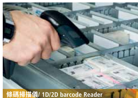
條碼掃描儀/ 1D/2D barcode Reader