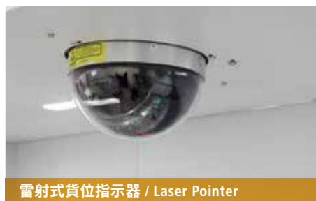
雷射式貨位指示器 / Laser Pointer